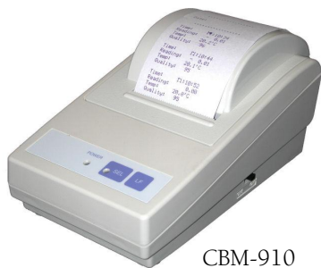
CBM-910 Miniature Dot Matrix Printer

For users requiring a GLP record from an instrument that does not support date/time printing, the DP-24 may be used, as it incorporates its own clock.